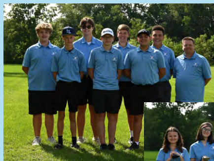
Above: Boys Golf Team